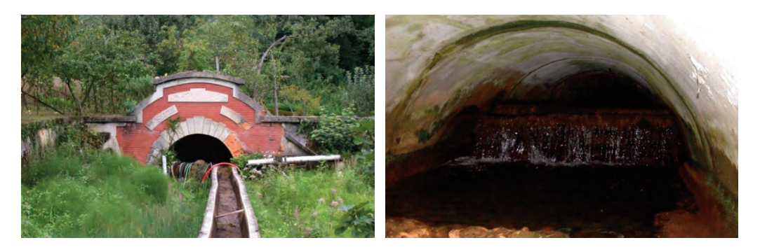
Figure 2 Photographs of a typical mountain mine and mine water output.