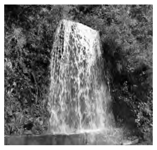
Figure 1 Waterfall from a mountain mine (net drop height = 5 m). Net height to the next river > 100 m.

This equipment consists of a beam system that acts as a lever machine, two cylinders with pistons as a water pump, valve clearance to get the pumping which in this case acts as a suction pump impeller, and lower and higher tank simulation, in order to act as a reservoir to pump and as a repository engine, a connecting pipe between the upper