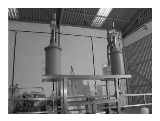
Figure 3 Photograph of the pumping system.

tank and beam, which is the central part of the system (fig.4).