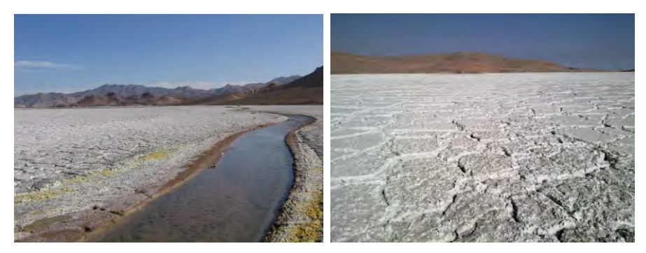
Figure 2 Tailings surface and flowing water

A major task in developing an effective treatment scheme and environmental management plan is the investigation of the environmental problems due to the long term generation of AMD and toxic metal pollution during the design stage of a large open pit mining operation. In this paper, the impacts of AMD on the quality of the water was investigated by collecting the water samples in the entrance and effluents from the Sarcheshmeh copper mine tailings dam and analyzing them for hydrogeochemical parameters.