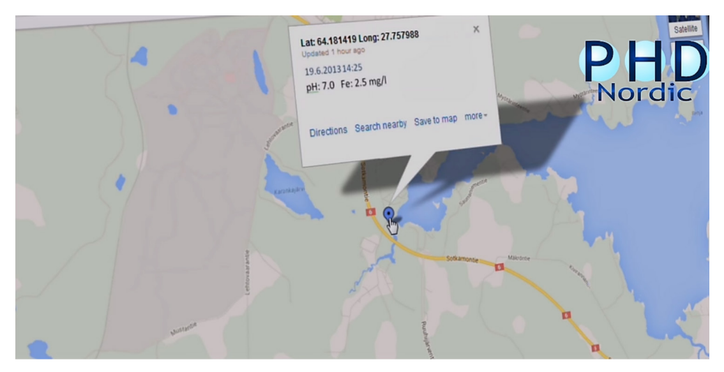
Picture 3 Monitoring results with location and time info.

issues, the colorimetric readings are calibrated and the measurement readings, i.e. the primary data, is run through a comparable data set to identify and eliminate deviations.