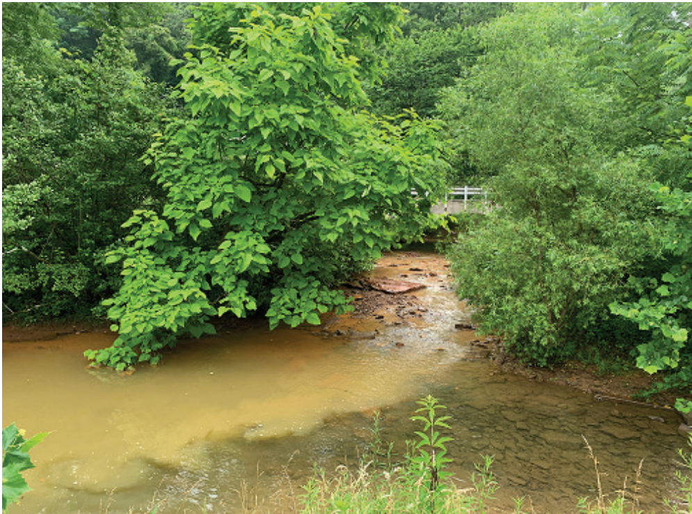
Figure 6 Confluence of Left and Right Fork Little Sandy Creek in Fellowsville, WV

The retrofitting of AMD treatment systems at F&M Coal mining permits in 2020 and the installation of in-stream dosers have demonstrated positive results. Monitoring efforts by the LMFACWA indicate improvements in benthic macroinvertebrates and fish populations in Left Fork Sandy Creek. While challenges remain, such as the increased stream embeddedness of LFLS Creek due to sludge precipitation and aesthetics in certain areas, collaborative efforts between the OSR and WVDEP aim to further enhance water treatment methods and address lingering environmental concerns.