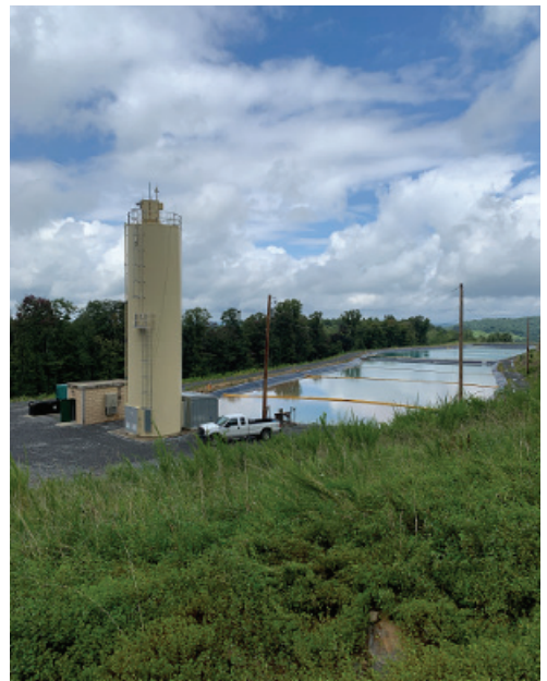
Figure 3 Main Silo at F&M Coal (image: Ben Fancher).

December 2016 to determine if in-stream treatment of AMD was feasible (Ziemkiewicz 2017). Based on water data collected throughout the Sandy Creek watershed, it was possible to elevate the alkalinity and increase the pH of the streams.