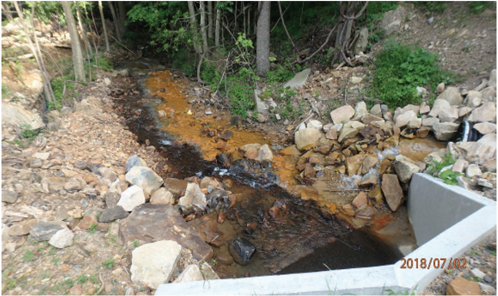
Figure 2 Iron and aluminum precipitating out in streambed causing staining

AMD flows. Treated water passes through settling ponds and limestone aggregate filters before discharge, with sludge pumped into a centralized cell.